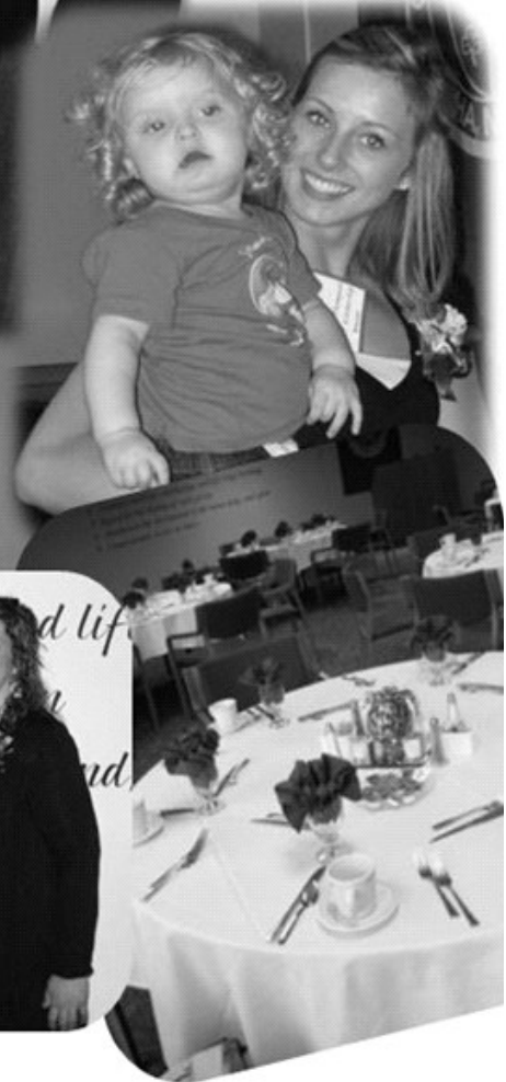
A future member of EWI